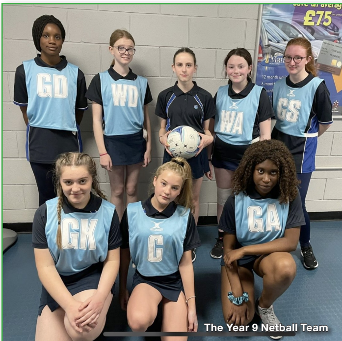
The Year 9 Netball Team