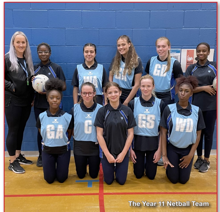
The Year 11 Netball Team

A big congratulations are due to our Year 9 and Year 11 Netball teams, who played brilliantly before the half term. Year 9 came 2nd in the city on 1st October, and Year 11 came 4th in the city the following week!