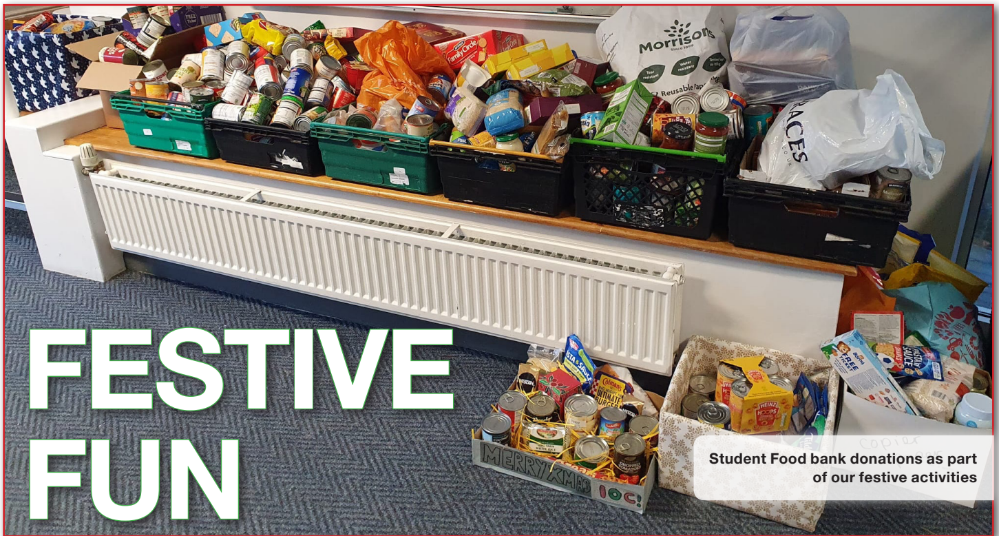
Student Food bank donations as part of our festive activities